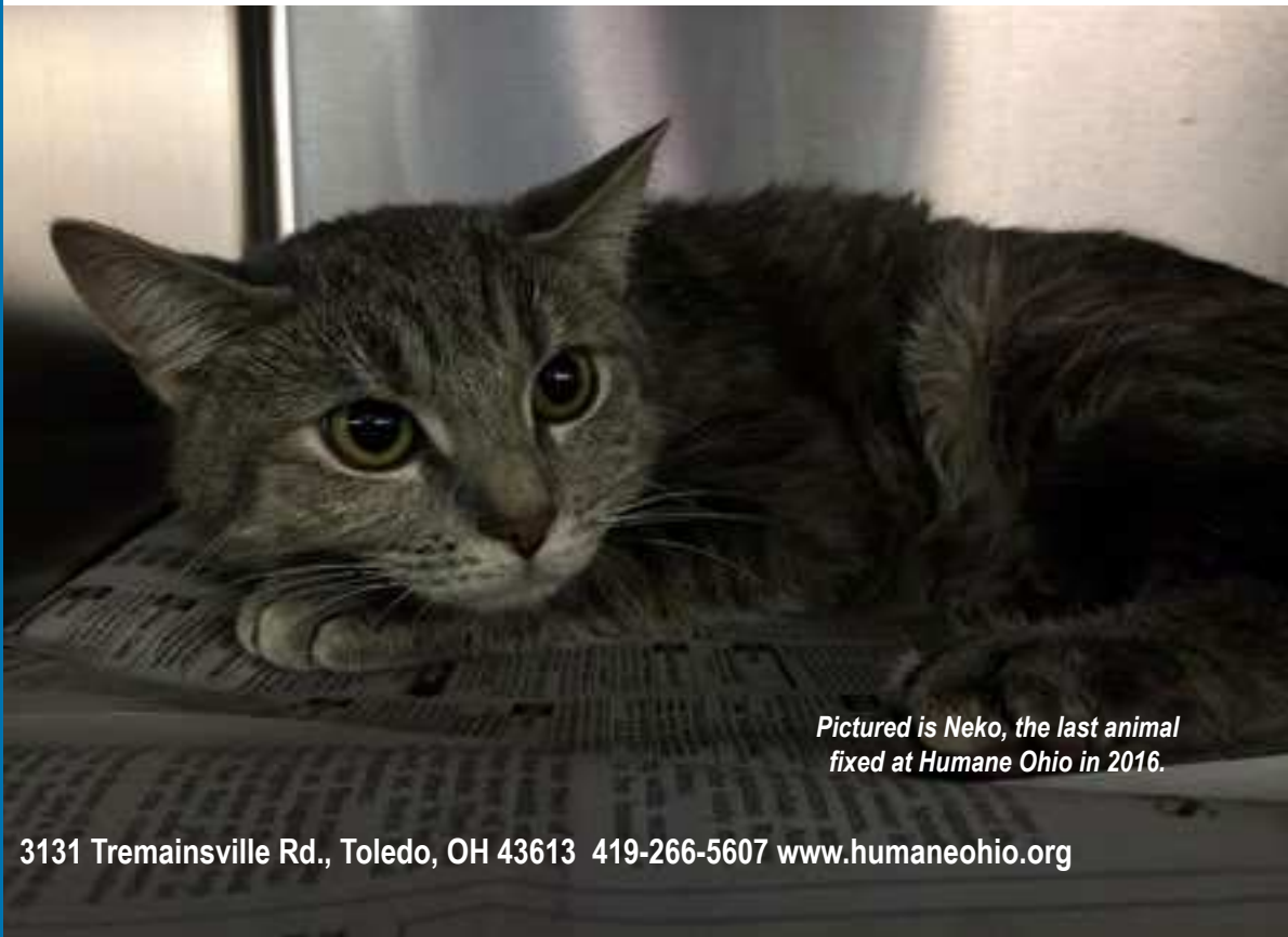
Pictured is Neko, the last animal fixed at Humane Ohio in 2016.

Humane Ohio spayed/neutered 15,576 cats and dogs in 2016!