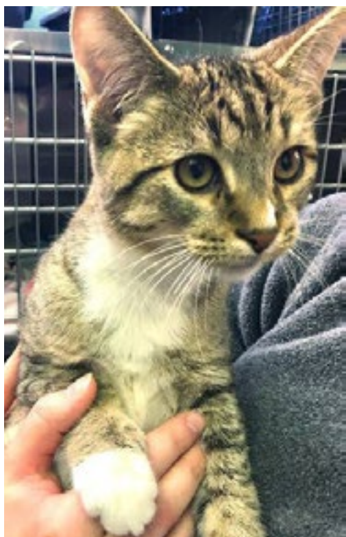
Pictured is Boots, the last animal fixed at Humane Ohio in 2017.

Humane Ohio spayed/ neutered 16,408 cats and dogs in 2017!