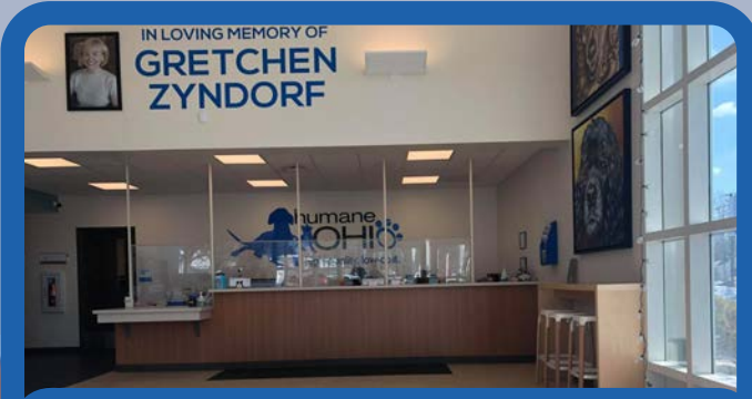
view of lobby after renovations